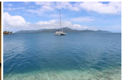
Blue lagoons - from Raiatea towards Taha'a