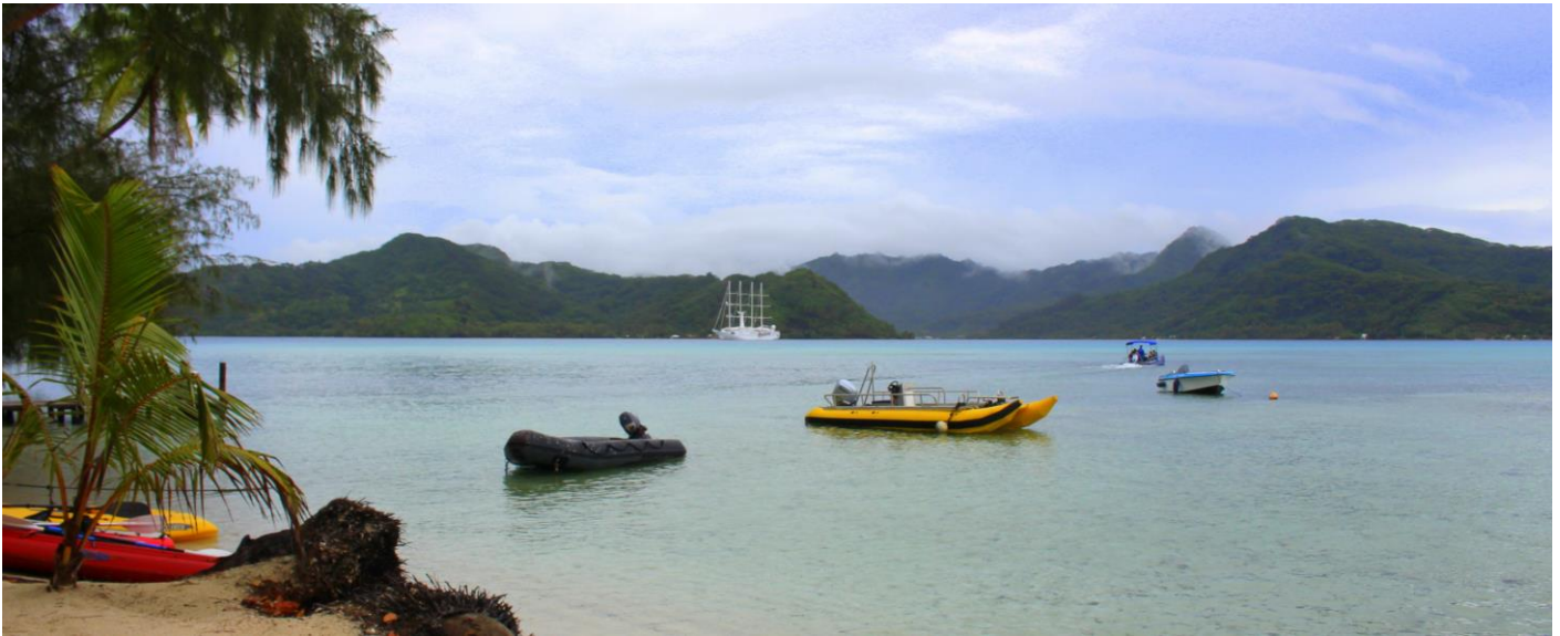
A day on the beach - at anchor in the Moorea Lagoon