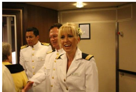
Friendly first-name service