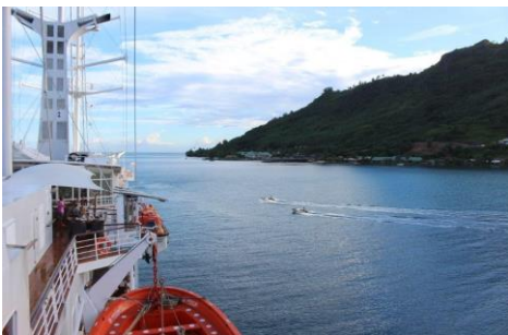
At anchor in the Moorea Lagoon

Images by: Gerard Murphy - Bon Voyage Cruises & Travel - on board Wind Spirit - January 2016