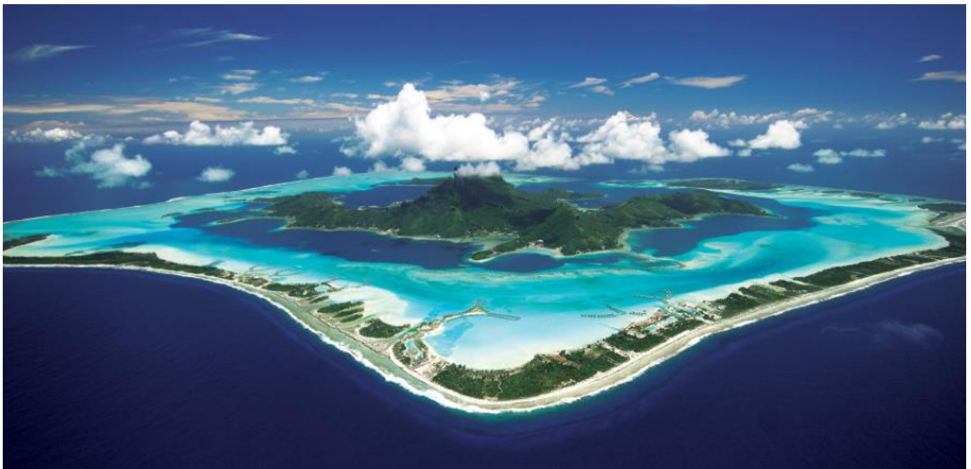
Bora Bora, French Polynesia